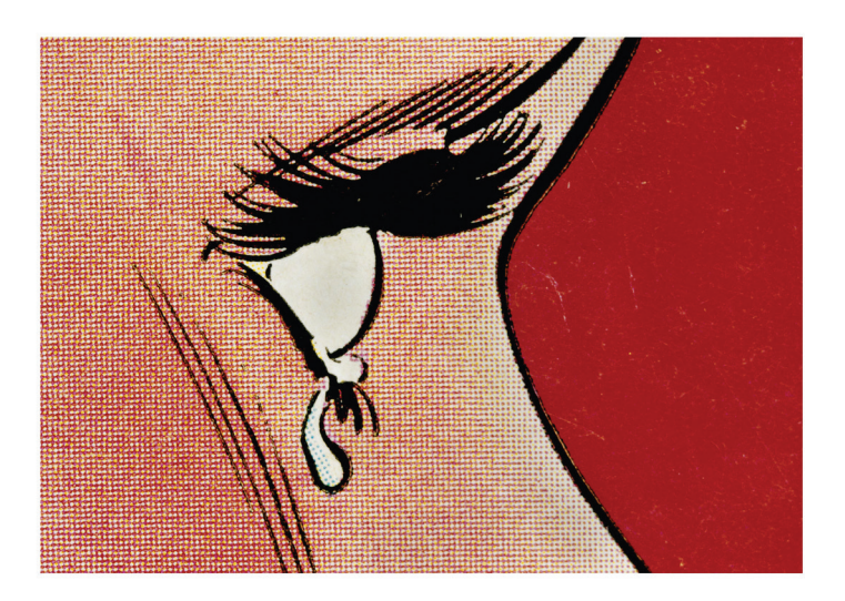
ANNE COLLIER. "WOMAN CRYING (COMIC) #3," 2018. C-PRINT. 49.7 X 68.84 INCHES (126.24 X 174.85 CM).

These images culminate with a projected work called Women With Cameras (Self Portrait) . This piece is a collection of photos Collier has accumulated over the years. Showing various women taking photos of themselves may not seem radical now in the era of Instagram, but these are all film and long before social media consumed our lives. As a result, these photos seem much more intimate, but what were originally meant as snapshots for these photographers have now been abandoned. Along with that loss comes another loss of intention and