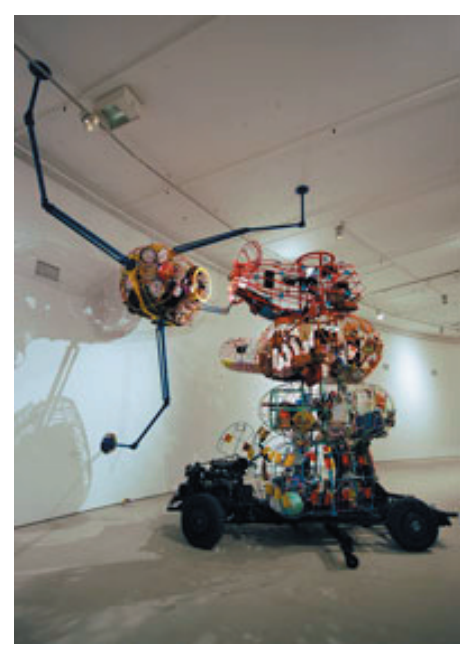
John Bock's "Curve-Vehicle incl. π-Man-(.)," 2010