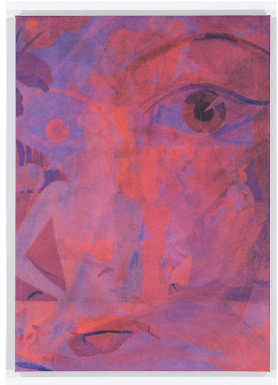
Nathaniel Axel, Aspects , 2015, Inkjet on primed linen, 53 1/4 x 38 inches (135.26 x 96.52 cm)