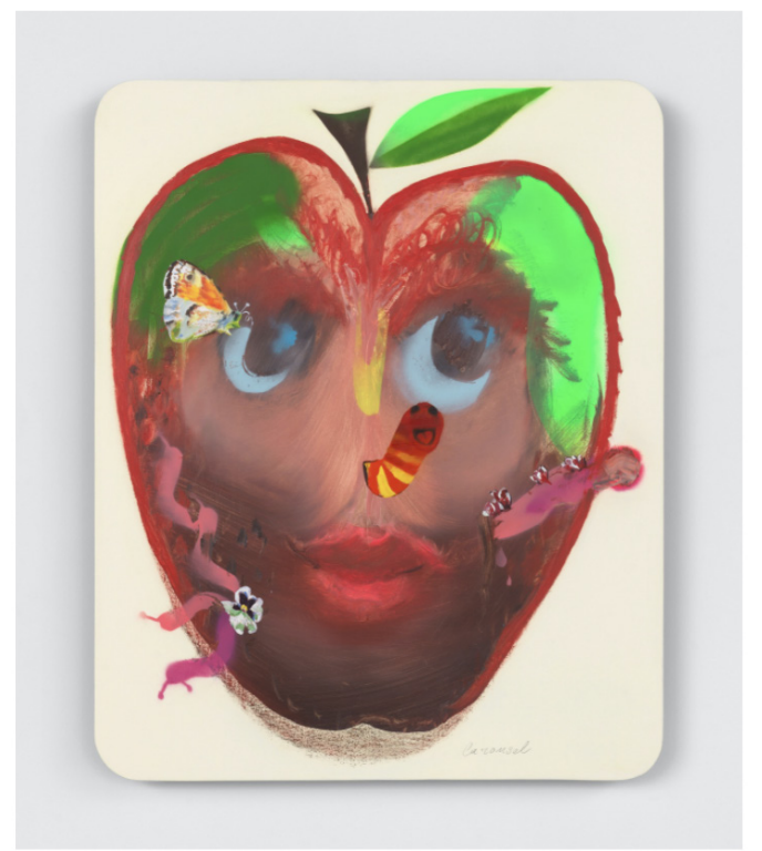
Alessandro Pessoli, Carousel, 2021. Oil, spray paint, and pencil on wood panel, 30 x 24 1/2 inches.

There are 11 paintings of figures and one smaller work that shares the name of the exhibition, Carousel . The 11 figurative works are all the basic shape of body-length mirrors and nearly the same size. This scale sets up a proportional relationship with the