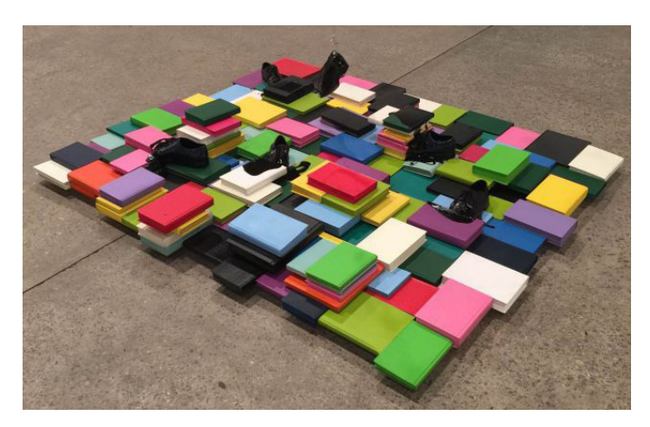
Part of Jim Lambie's exhibition "Train in Vein" at Anton Kern Gallery.

The triad of book pieces each frame a different floating lowbrow wonder: an infinite squiggle of connected bike tires, turned-over chairs draped with a multitude of Op-inspired kerchiefs, and a hanging chain that's flowered by wingtip shoes and cheap sunglasses (a nod both to Magritte and 60's mod style). The works culminate at the top of the gallery's planked ceiling, each ending in its own glitzy retro suitcase and each emblazoned with a different play on a legendary punk song title.