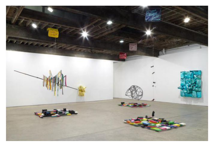
Installation view of "Train in Vein" by Jim Lambie, 2015.

Jim Lambie puts fun ahead of strategy in his latest show at Anton Kern By Ryan Steadman | 11/14/15 8:09pm