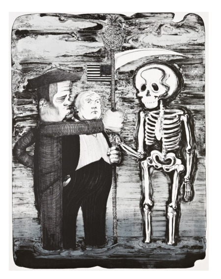
Tea Party (2012), two-color lithograph. Edition: 25. Paper size: 48-3/4 x 37-1/8 in. Courtesy: Jungle Press Editions