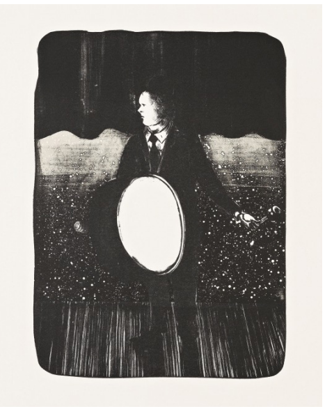
Drummer (2011), 2-color lithograph. Edition: 25. Paper size: 22 x 16-3/4 in.