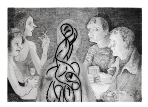
Nicole Eisenman, Drinks with Possible Spirit Type Entity , 2012, etching and aquatint on white wove paper, measuring 10 1/4 x 11 3/4 inches. Plate size 5 x 7 inches. Printed and published by Harlan & Weaver, New York.