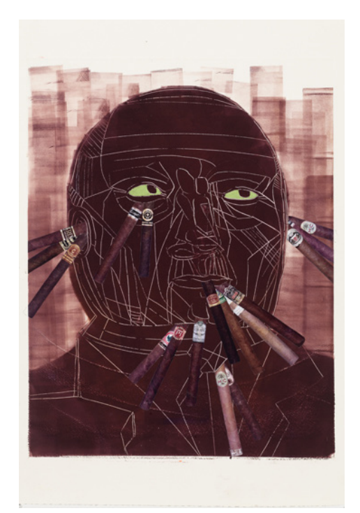
Untitled 2012 Monotype on paper Image size: 24 3/8 \times 18 3/4 in (61.9 \times 47.6 cm) Frame size: 28 1/2 \times 23 1/2 in

Tanything. It's a good old-fashioned women's collective, really well run, with really good equipment. I made the monotypes I'm showing at the gallery there. The ones at the Whitney I did in Brooklyn on a press I rented from [artist and master printer] Lothar Osterburg.