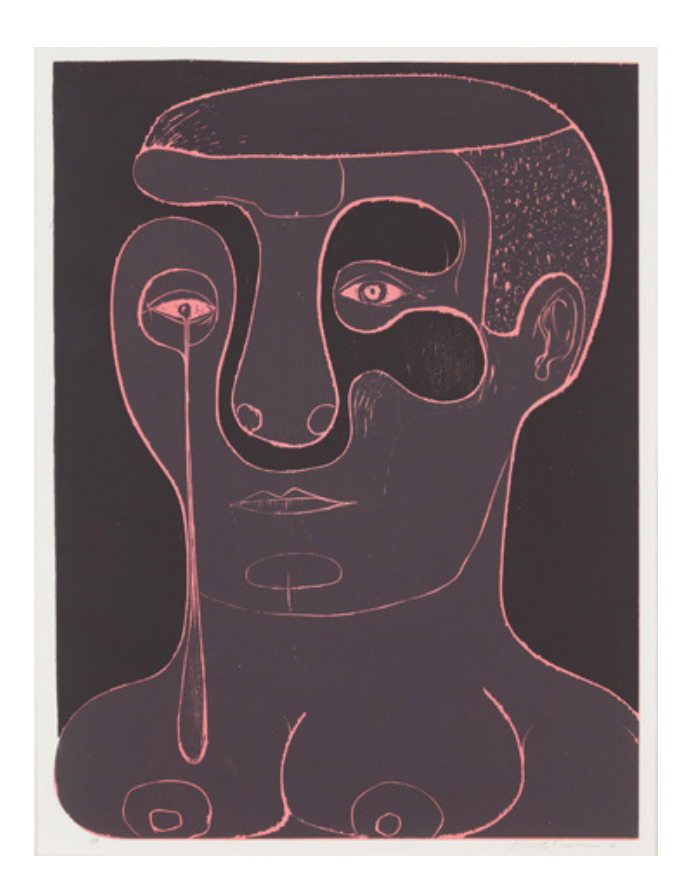
Untitled 2012 Woodcut Image size: 24 \frac{1}{4} \times 18 \frac{1}{4} in Frame size: 29 \frac{1}{8} \times 23 \frac{1}{8} in Edition of 20

The tough part is that you're working in front of people; there's an awkwardness of having to think on the spot. That's why there are a lot of scenes of people drinking.