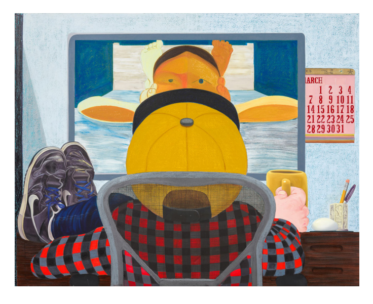
Nicole Eisenman, "Long Distance" (2015), oil on canvas, 65 x 82 inches

Uninterested in lowering or raising the bar, in finding a mechanical alternative to the paint brush or in making a signature commodity (remember that guy who got famous by painting badly on broken dishes?) – all conventional macho choices – Eisenman is fascinated by the challenge of making paintings and drawings about whatever crosses