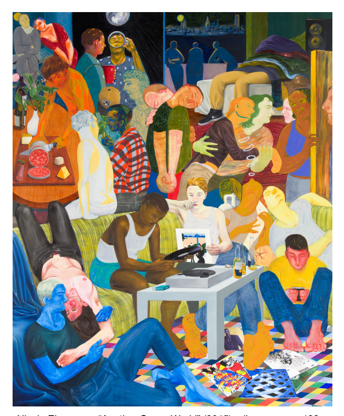
Nicole Eisenman, "Another Green World" (2015), oil on canvas, 128 x 106 inches