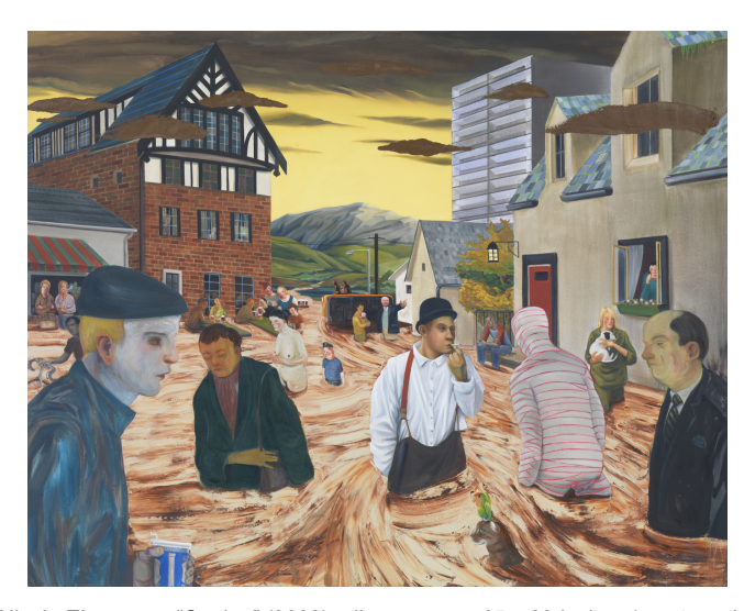
Nicole Eisenman, "Coping" (2008), oil on canvas, 65 x 82 inches (courtesy the artist, Susanne Vielmetter Los Angeles Projects, and Galerie Barbara Weiss; Photo © Carnegie Museum of Art)

Another subject is signaled by the title of two large related paintings, "Shooter 1" and "Shooter 2" (both 2016), in which a cropped, abstracted face points a gun straight at you. Across from each other, the gun's round black muzzle