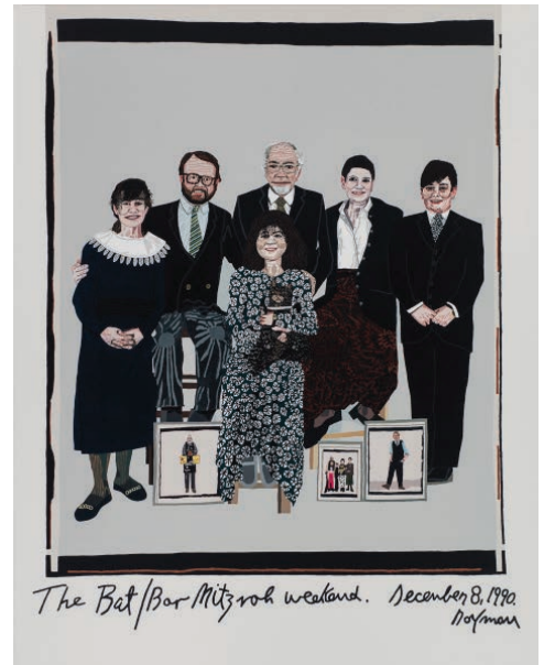
The Bat/Bar Mitzvah Weekend , 2016, oil and acrylic on canvas, 88 x 69 inches.