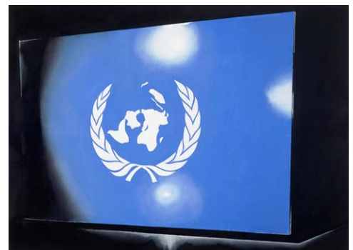
UN , 2015, oil on canvas, 63 x 86.6 inches.