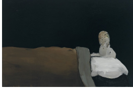
Brian Calvin Untitled (Popeye) , 1992 Oil on canvas 26 x 38 1/2 inches (66.04 x 97.79 cm) (ak#12568)