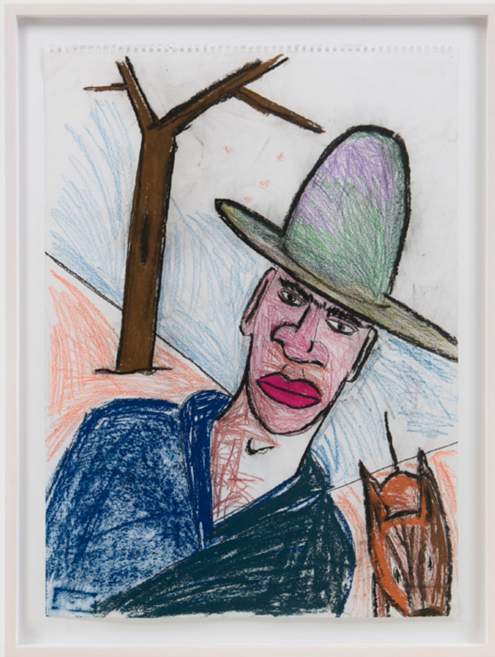
Marcus Jahmal Untitled , 2024 Colored pencil on paper Framed: 28 1/4 x 21 3/4 x 1 1/2 inches (71.8 x 55.2 x 3.8 cm)