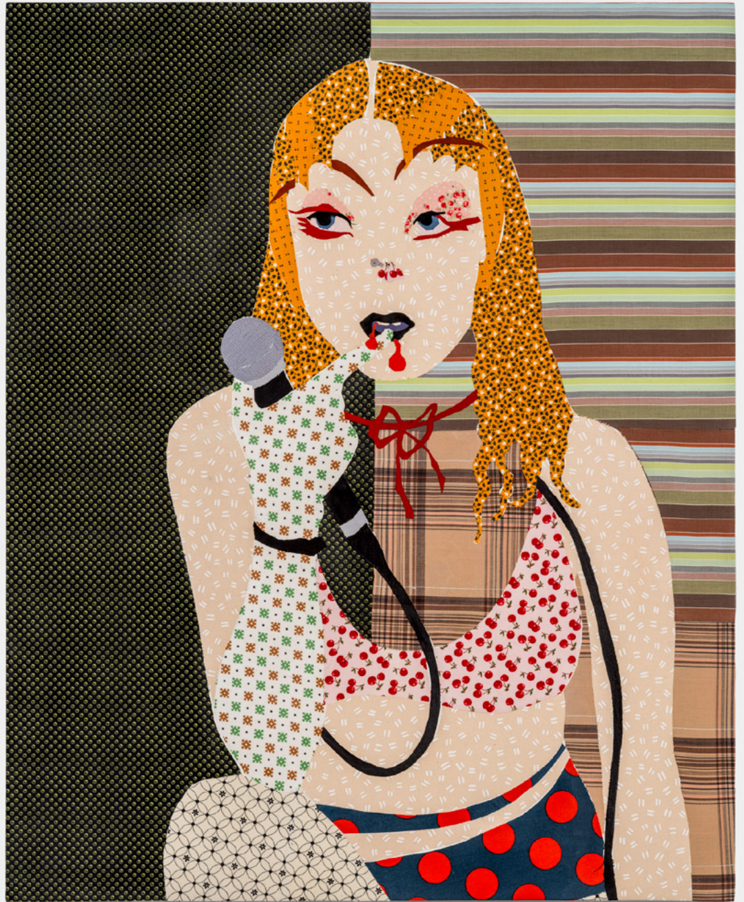
Lara Schnitger Mary , 2023 Fabric collage on canvas 32 x 26 inches (81.3 x 66 cm)