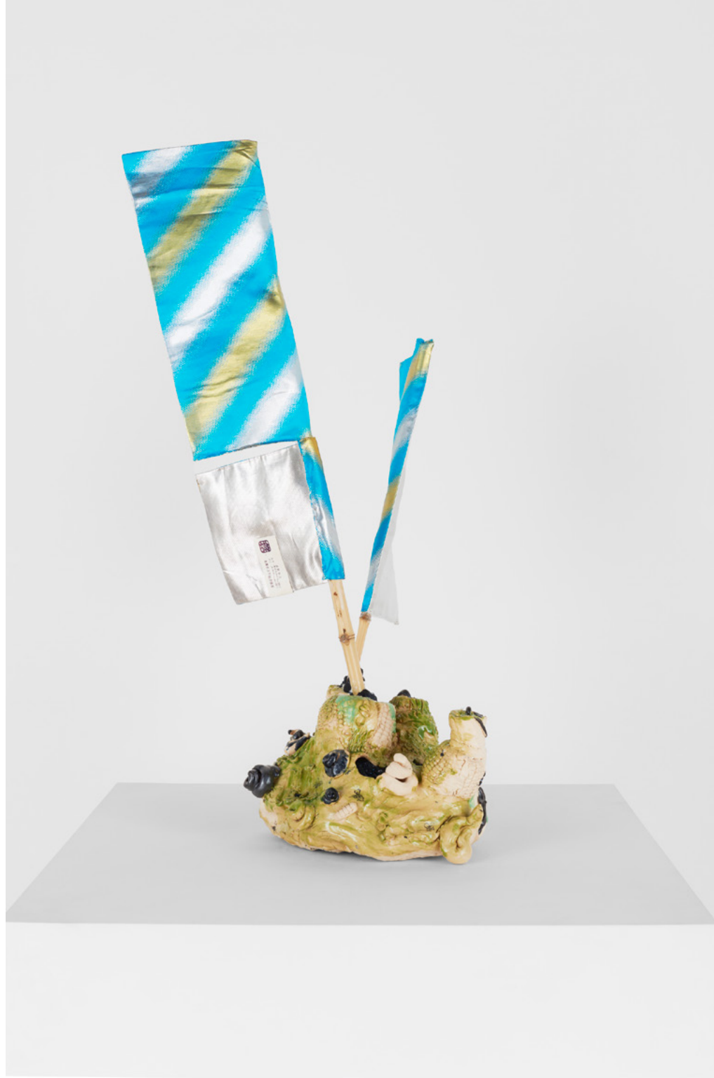
Yuli Yamagata Three Flags Ikebana , 2024 Silk, bamboo, glazed ceramic, papier-mâché, epoxy resin, anti-UV spray 29 1/8 x 11 3/4 x 13 3/4 inches (74 x 30 x 35 cm)