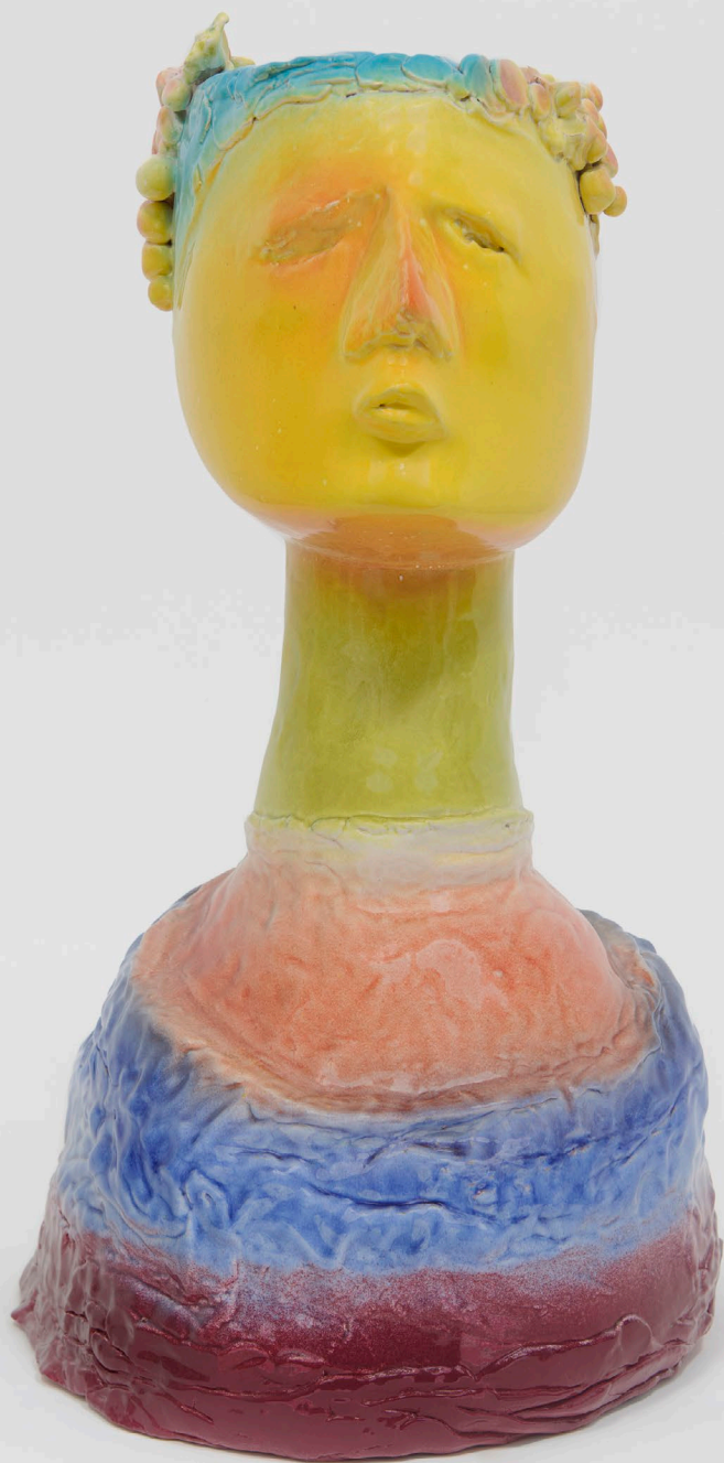
Alessandro Pessoli The Sphinx , 2012 Painted maiolica 20 x 13 x 11 inches