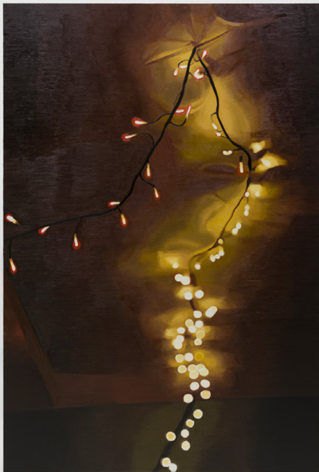
Mike Silva Lights , 2025 Oil on linen 86 5/8 x 59 inches (220 x 150 cm)