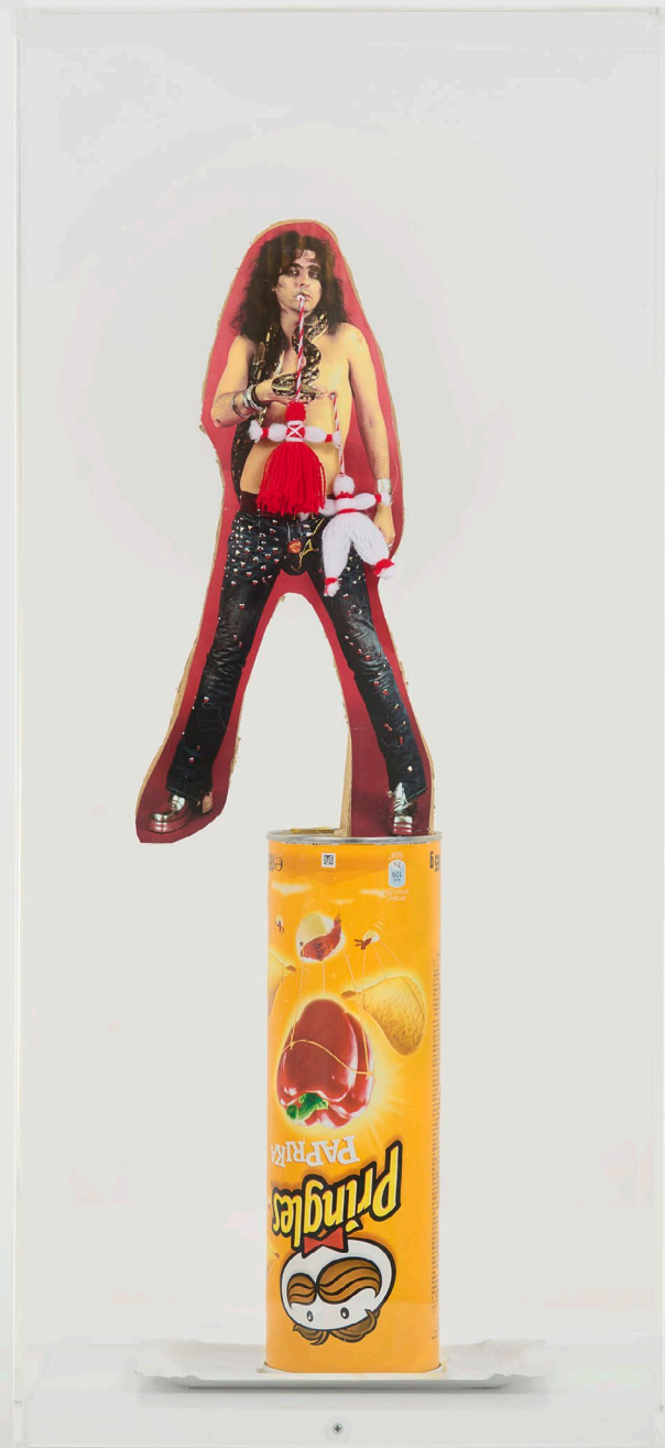
John Bock Untitled (Alice Cooper), 2012 Paper, ink and cardboard on pringles package 23 3/8 x 10 5/8 x 8 inches