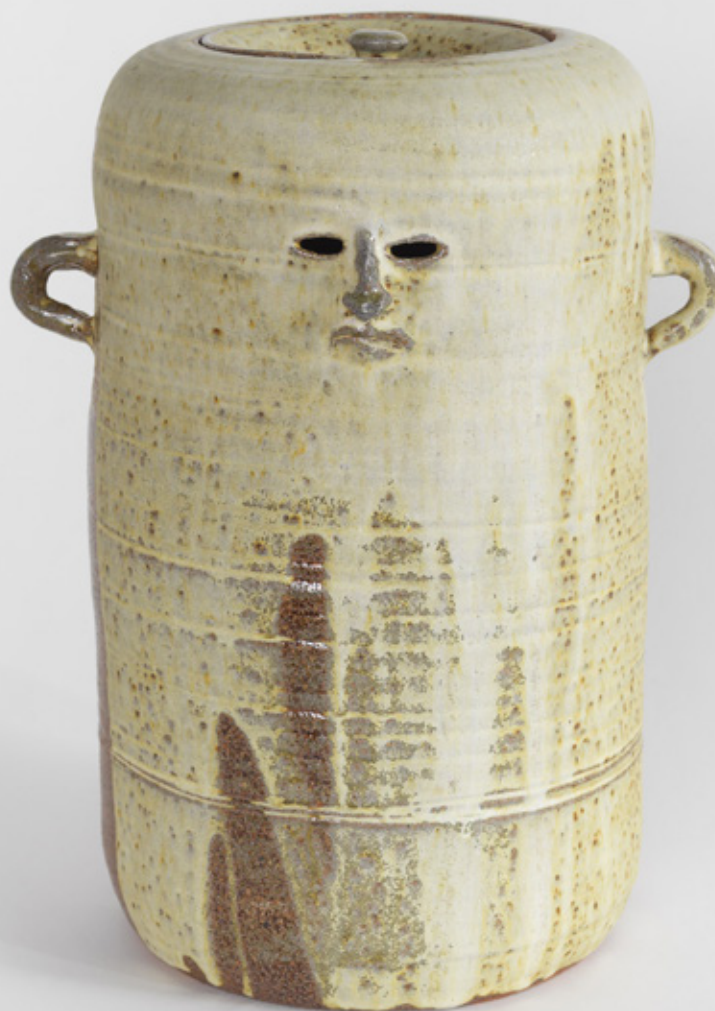
Francis Upritchard Tall Toothpaste Jar , 2018 Long Beach Clay with Hippy white exterior and Amber Celadon Interior Glaze 15 x 11.5 x 8 inches (37.5 x 29 x 24 cm)