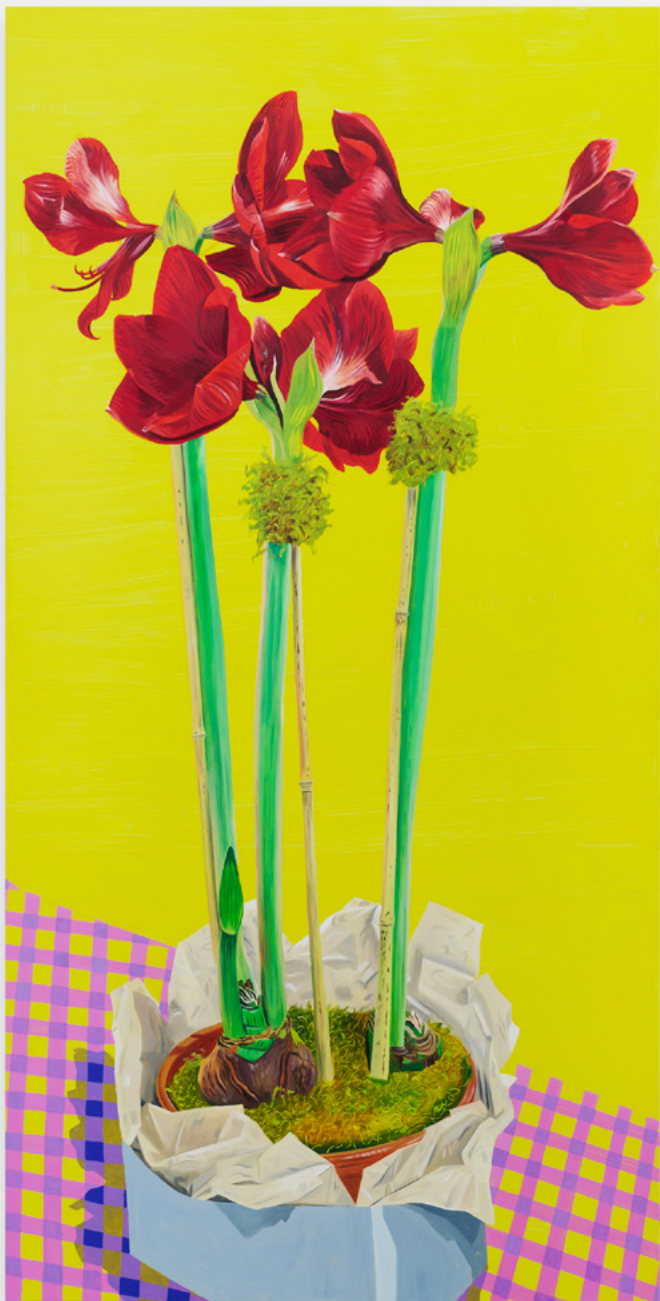
Aliza Nisenbaum Amaryllis in Red , 2025 Oil on dibond 72 x 36 inches (182.9 x 91.4 cm)