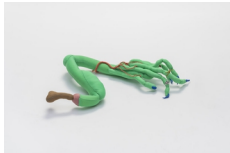
Yuli Yamagata Nosferatu , 2021 Elastane, silk, ring, cold porcelain, sewing thread, silicone fiber, rope, and aluminum 35 3/8 x 19 3/4 x 4 inches (90 x 50 x 10 cm)