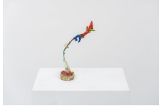
Yuli Yamagata Ikebana galinha , 2021 Paintbrush, polyester resin, flexible aluminum, cold porcelain, and acrylic 16 1/2 x 5 7/8 x 11 3/4 inches (42 x 15 x 30 cm)