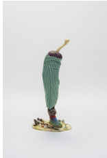
Yuli Yamagata Pema de pijama , 2021 Elastane, patterned fabric, silicone fiber, flexible aluminum, polyester resin, sewing thread, dehydrated fish and flower, popcorn, contact lens packaging, and toothbrush 37 3/8 x 17 3/4 x 13 inches (95 x 45 x 33 cm)