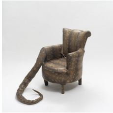
Yuli Yamagata Poltrono I , 2018 Armchair, printed fabric, glue spray, and silicone fiber 37 3/8 x 27 1/2 x 27 1/2 inches (95 x 70 x 70 cm)