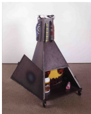
John Bock Untitled , 2004 Metal, fabric and mixed media 51 x 27 3/4 x 28 inches (AK#3367)