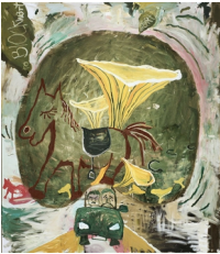
Bendix Harms Last Exit Bleckede , 2003 Oil on canvas 90 1/2 x 78 3/4 in 230 x 200 cm (AK#3345)