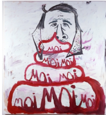
Bendix Harms Tittenbendix , 2003 Oil on canvas 58 1/2 x 52 1/2 in 150 x 135 cm (AK#3353)