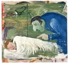
Bendix Harms Der Fütterer (The Feeder) , 2003 Oil on canvas 76 x 82 in 195 x 210 cm (AK#3347)