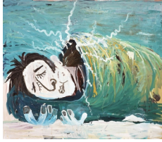
Bendix Harms Amok , 2003 Oil on canvas 50 3/4 x 58 1/2 in 130 x 150 cm (AK#3352)