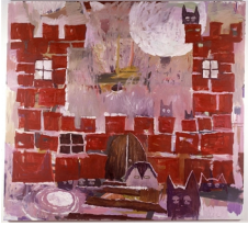
Bendix Harms Kleinburgsieben , 2002 Oil on canvas 78 3/4 x 85.8 inches 200 x 220 cm (AK#3346)