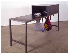
John Bock Untitled , 2004 Metal and fabric 49 1/2 x 86 1/2 x 27 1/2 inches (AK#3368)