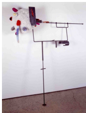
John Bock Untitled , 2004 Metal, fabric and sausage 72 x 70 x 17 inches (AK#3366)