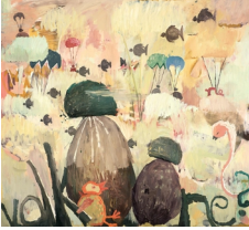
Bendix Harms Volk, ne? (People, Huh?) , 2002 Oil on canvas 74 x 82 in 190 x 210 cm (AK#3348)