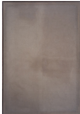
Sergej Jensen Untitled (Cross) , 2008 Acrylic on linen 78 3/4 x 53 1/4 inches (AK#5866)