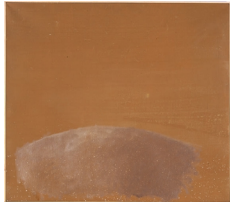
Sergej Jensen Ochre Eternity , 2008 Tempera and acrylic on canvas 27 3/4 x 31 1/2 inches (AK#5861)