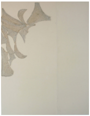
Sergej Jensen Untitled (Pearls), 2008 Raw silk, muscle-shell beads, and thread 86 3/4 x 67 inches 220 x 170 cm (AK#5869)