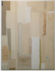
Sergej Jensen Untitled, 2008 Mixed fabrics and thread 94 5/8 x 122 inches 250 x 310 cm (AK#5867)