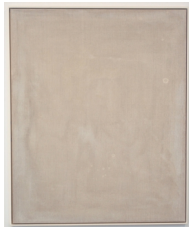
Sergej Jensen Untitled , 2008 Acrylic on hemp 64 7/8 x 53 inches (AK#5864)