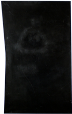
Sergej Jensen Untitled , 2008 Acrylic on hemp 59 1/8 x 35 1/2 inches (AK#5862)