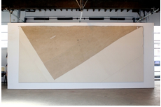
Sergej Jensen Sail, 2008 Sail and raw silk on linen 114 1/4 x 256 inches 290 x 650 cm (AK#5868)