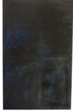
Sergej Jensen Erasing No. II , 2008 Oil, tempera, and acrylic on canvas 53 1/4 x 33 1/2 inches (AK#5859)