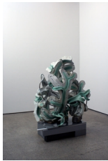
Michael Joo Anemone , 2009 Bronze, patina and enamel paint, steel base 73 x 50 x 34 inches Edition of 3 and 1 AP (AK#7219)