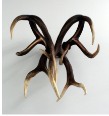
Michael Joo Felled/Held , 2009 Cast urethane, acrylic enamel paint and steel 31 x 27 x 20 inches (AK#7217)