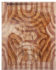
Michael Joo Faceted Composition #3 , 2008 Acrylic, ink, pencil, black tea, UV stable gel medium on canvas 60 x 48 1/4 inches (AK#7208)