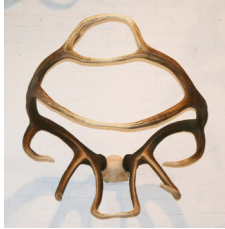
Michael Joo Godseye 1 , 2008 Cast urethane, acrylic enamel paint and steel. 31 x 29 x 31 inches (AK#7218)