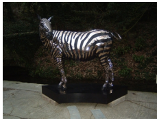
Michael Joo Stubbs (Absorbed) , 2009 Bronze, patina 73 1/2 x 83 x 44 inches Edition of 3 and 1 AP (AK#7220)