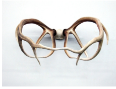
Michael Joo Cradle , 2009 Cast urethane, steel and acrylic enamel paint 22 x 42 x 27 inches (AK#6853)