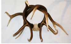
Michael Joo Knot 2 , 2008 Cast urethane, acrylic enamel paint and steel (AK#7229)