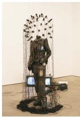
Michael Joo Future Perfect (Dulcinea) , 2009 Authentic flight suit from Battleship Galactica TV series, mannequin, live-feed video cameras, monitors, fluoroscopic video image, electronics 82 x 30 x 46 inches (AK#7205)