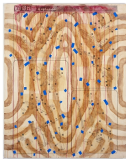
Michael Joo Faceted Composition #2 , 2008 Acrylic, ink, pencil, black tea, UV stable gel medium on canvas 60 x 48 1/4 inches (AK#7207)