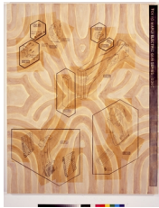
Michael Joo Faceted Composition #1b , 2008 Acrylic, ink, pencil, black tea, UV stable gel medium on canvas 60 x 48 1/4 inches (AK#7206)