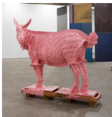
Michael Joo Doppelganger (Pink Rocinante) , 2009 Bronze and enamel paint 77 x 76 x 44 inches Edition of 3 and 1 AP (AK#7221)