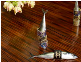
Roe Ethridge Chanel Bracelets with Mackerel, 2013 C Print 41 5/8 x 55 in (105.7 x 139.7 cm)