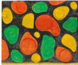
Chris Martin Untitled, 2008 Oil and spray paint, burlap and collage on canvas 43 x 52 inches (132.1 x 109.2 cm)