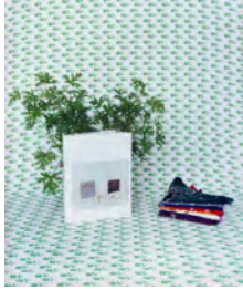
Annette Kelm Untitled (Jahresring), 2010 C Print 27 1/4 x 32 1/2 inches (69.22 x 82.55 cm)