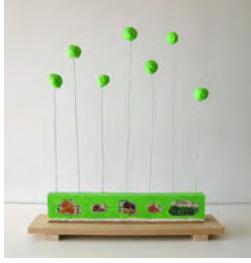
B Wurtz Untitled, 2013 Wood, newspaper collage, wire, acrylic paint and papermache 25 1/4 x 22 1/4 x 5 1/2 inches