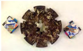
Nancy Shaver A Hybrid (a decorative ensemble) , 2014 2 diamond shaped wall works, zodiac mirror, wooden blocks, dress fabric, flannel, paper, Flashe acrylic, house paint and oil pastel Variable dimensions