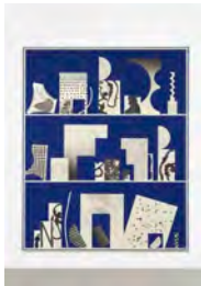
David Korty Blue Shelf #23, 2014 Acrylic, ink, paper, canvas 72 x 90 inches (182.9 x 228.6 cm)