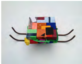
Nancy Shaver Go to RICHIE RICH, Cobleskill, NY , 2013 Found metal, found fabric roses, fabric, paper, Flashe acrylic paint, house paint, oil pastel 9 x 27 x 12 inches