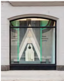
Diane Simpson Window 2, Window dressing: Bib-dots, 2006/07 Gatorboard, perforated steel, wood, enamel, UV-protected cotton, and Masonite 96 x 120 x 23 inches