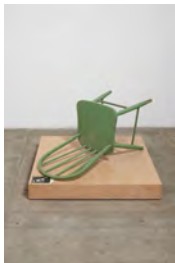
Tom Burr fallen backwards, 2010 Plywood base, a postcard of Walt Whitman, and a green painted chair 22 x 36 x 36 inches (55.9 x 91.4 x 91.4 cm)