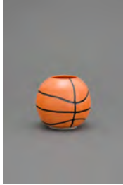
Shio Kusaka (basketball 1) , 2013 Porcelain 5 1/2 x 5 3/4 x 5 3/4 inches