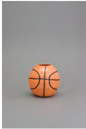
Shio Kusaka (basketball 2) , 2013 Porcelain 8 1/2 x 8 1/2 x 8 1/2 inches